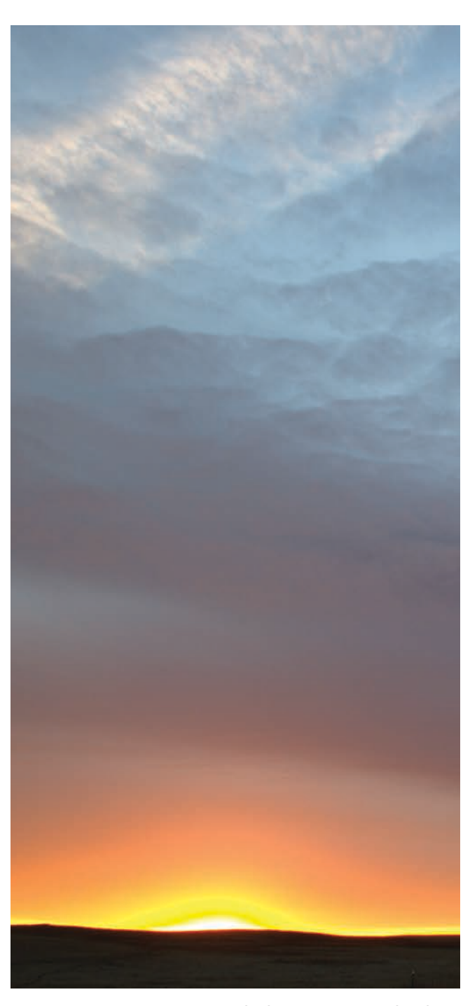
Rosebud Reservation, South Dakota.