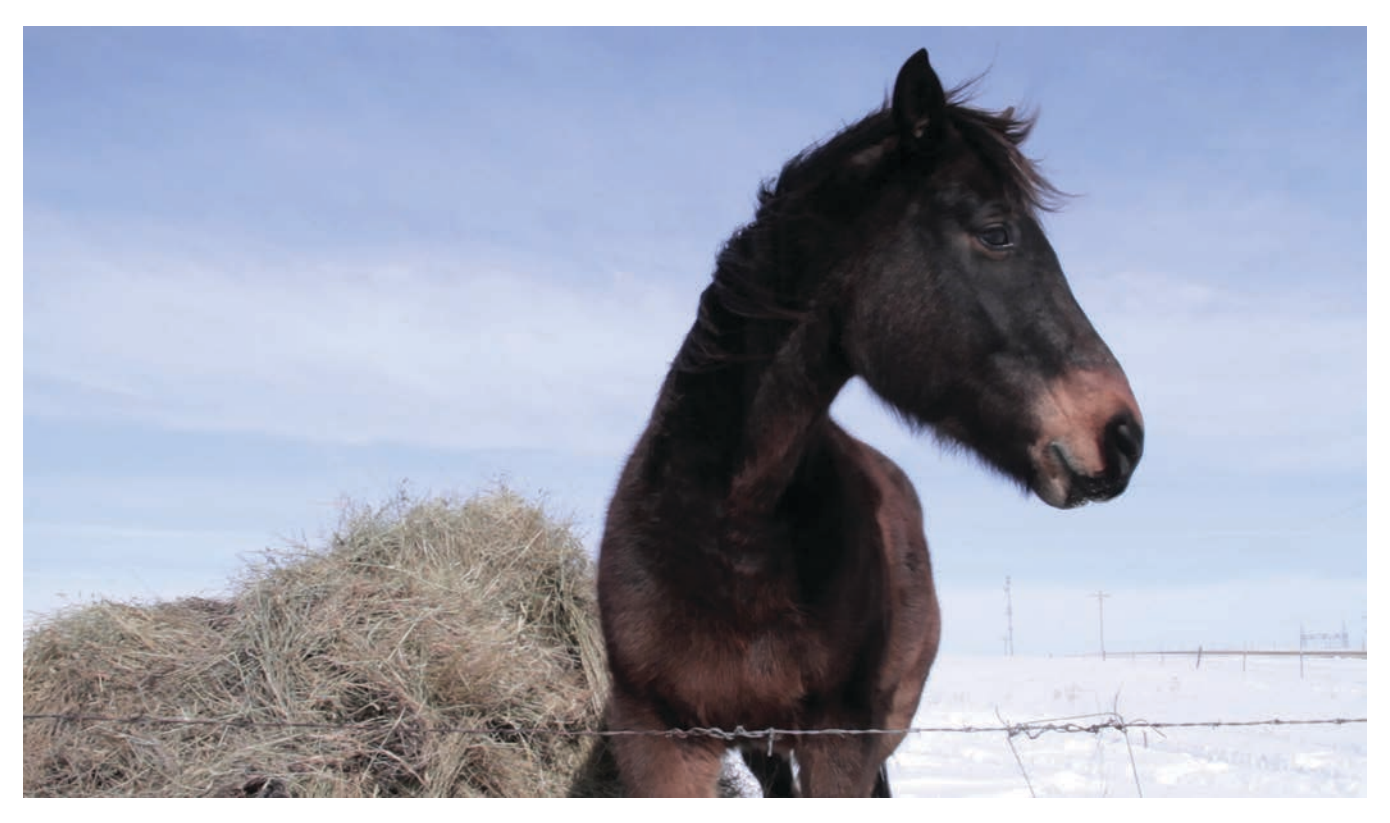
Learning/Media Activity Suggestions: