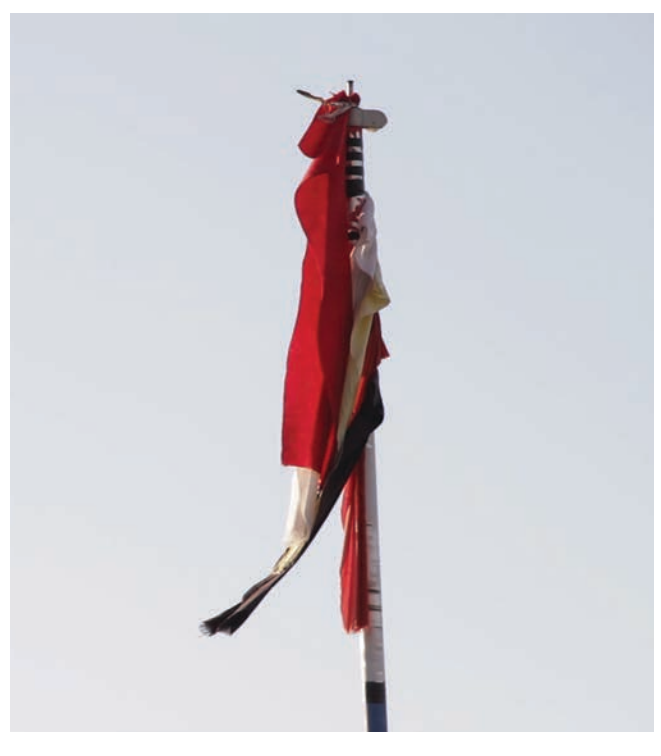
Prayer Flag on the Rosebud Reservation, South Dakota.

Across the Creek shows the Rosebud Sioux community reclaiming culture and traditions as a way to address these social problems. Families are working to become more engaged in education and recreational endeavors of their children. Healthy eating trends are being embraced, along with daily exercise.