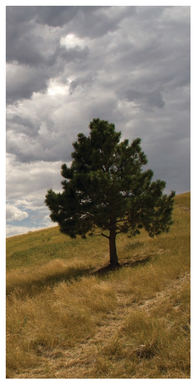
Pine Ridge Reservation, South Dakota.

For more information, consult: http://www.corestandards.org/ELA-Literacy