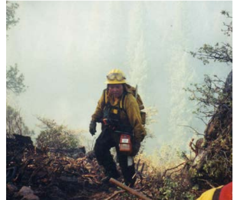
Apache 8 in the smoke.