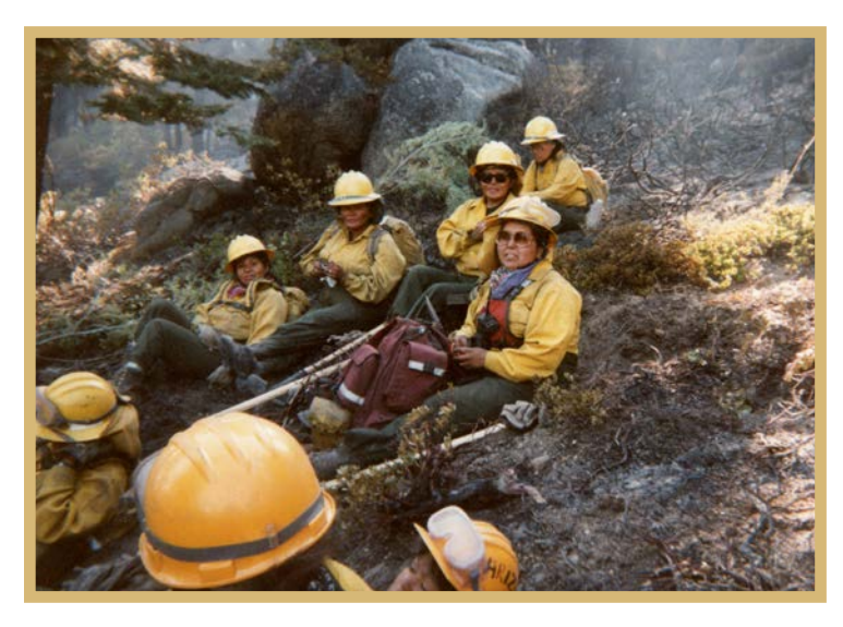
The Apache 8 crew pauses during another long day.