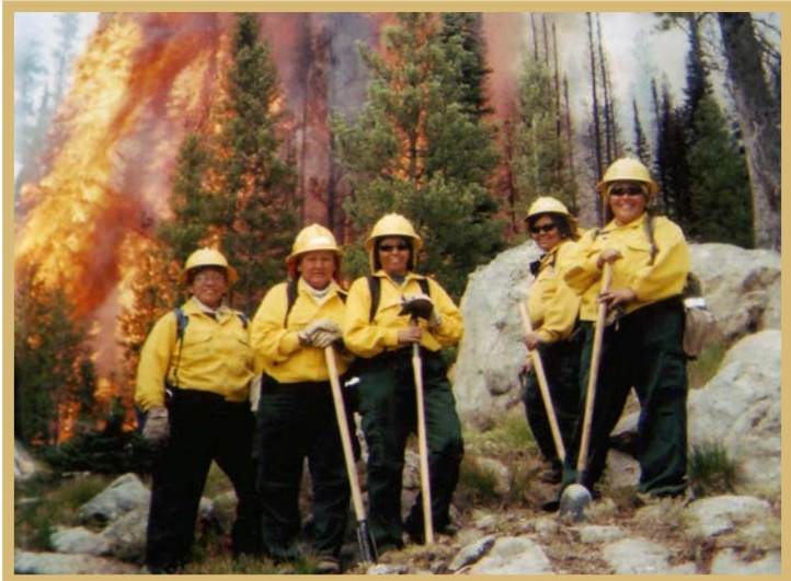
Apache 8 crew on a fire.